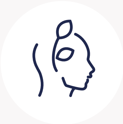
COMMITTED TO TRAINING AND DEVELOPMENT