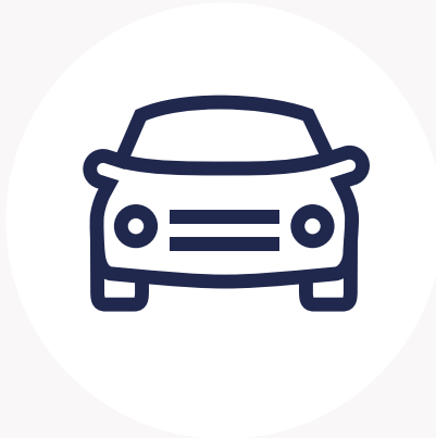
FREE ONSITE PARKING