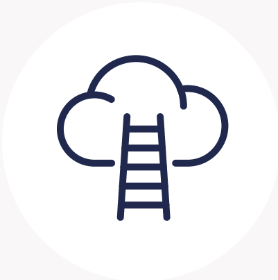
DEATH IN SERVICE BENEFIT