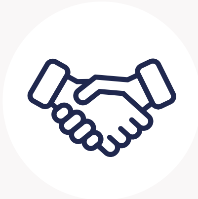
EMPLOYEE ASSISTANCE PROGRAMME