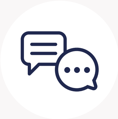
STAFF SOCIAL EVENTS