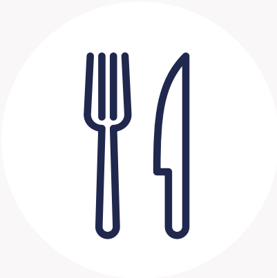
MEALS DURING TERM TIME