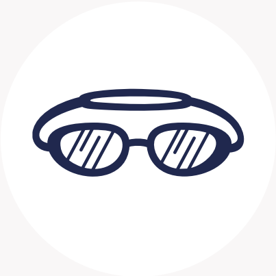
USE OF INDOOR AND OUTDOOR SWIMMING POOL