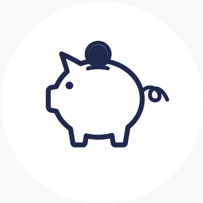
GENEROUS CONTRIBUTORY PENSION SCHEME